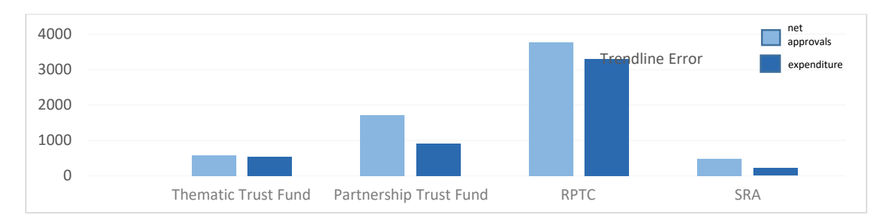
Net approvals and expenditure 2020

Regular programme of technical cooperations Percentage of expenditures